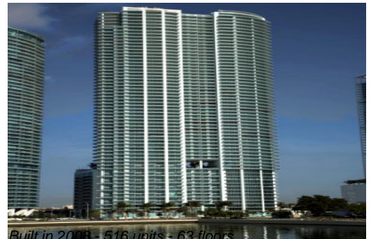
Built in 2008 - 516 units - 63 floors