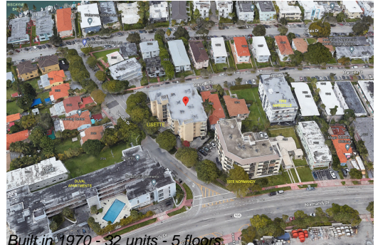
Built in 1970 - 32 units - 5 floors