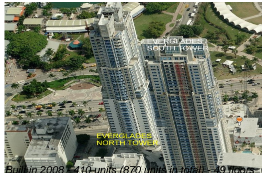
Built in 2008 - 410 units (870 units in total) - 49 floors