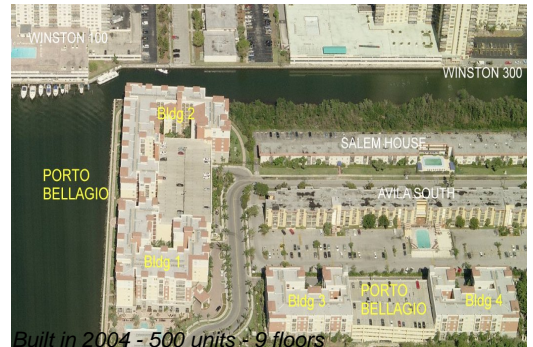
Built in 2004 - 500 units - 9 floors