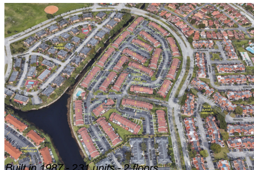
Built in 1987 - 231 units - 2 floors