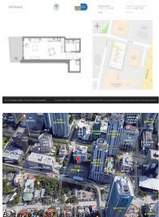
Built in 2017 - 387 units - 49 floors