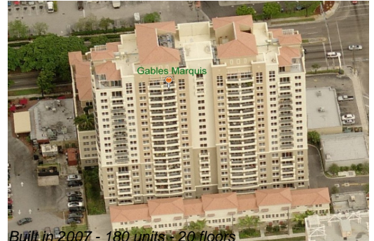
Built in 2007 - 180 units - 20 floors