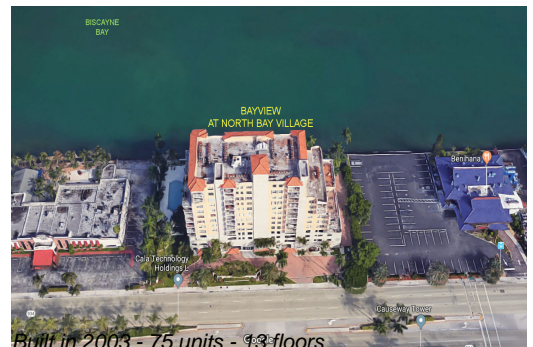
Built in 2003 - 75 units - 13 floors