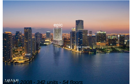
MIAMI 2008 - 342 units - 54 floors