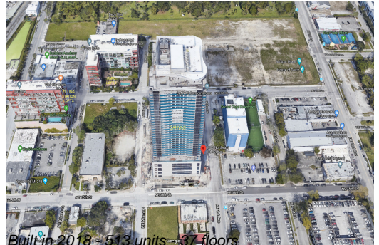
Built in 2018 - 513 units - 37 floors