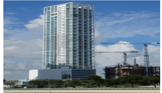
Built in 2007 - 200 units - 48 floors