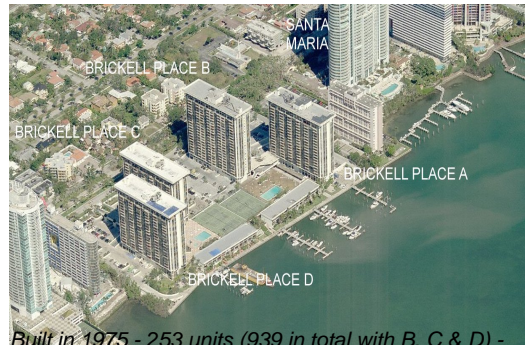
Built in 1975 - 253 units (939 in total with B, C & D) - 23 floors