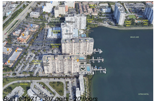
Built in 1971 - 307 units - 20 floors