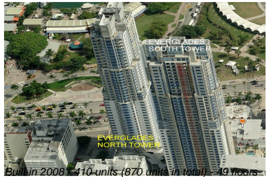
Built in 2008 - 410 units (870 units in total) - 49 floors