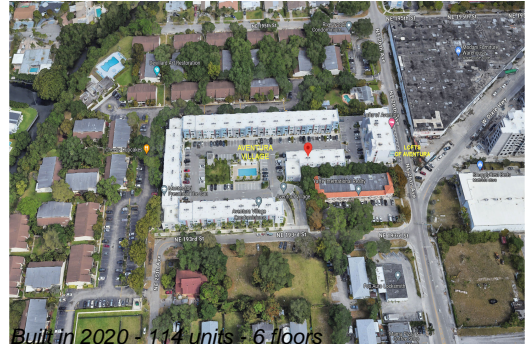
Built in 2020 - 114 units - 6 floors