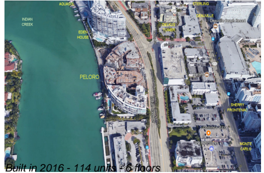
Built in 2016 - 114 units, 16 floors