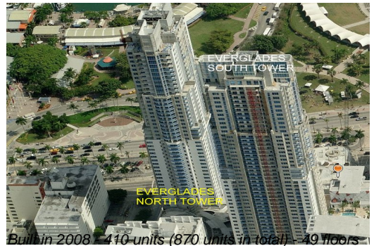
Built in 2008 - 410 units (870 units in total) - 49 floors