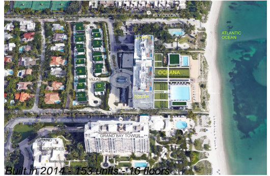
Built in 2014 - 153 units - 16 floors