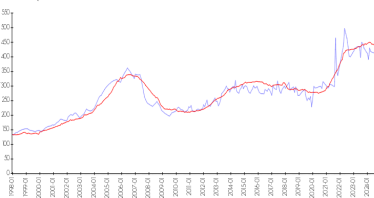
Mystic Pointe Tower 200 vs Aventura