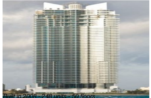
Built in 2008 - 248 units - 50 floors