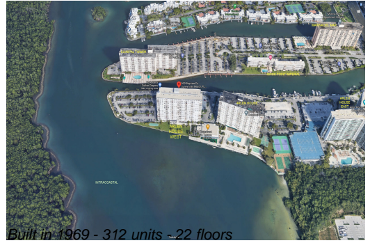
Built in 1969 - 312 units - 22 floors

The above valuated price is a baseline figure that does not take into account any specific renovation, upgrade, split, merge, or deterioration of the unit.