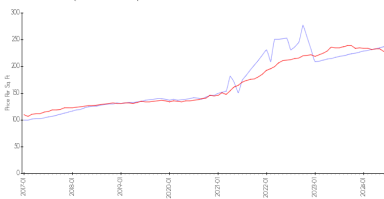
Monterey at Malibu Bay vs Homestead