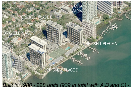
Built in 1980 - 228 units (939 in total with A, B and C) - 23 floors