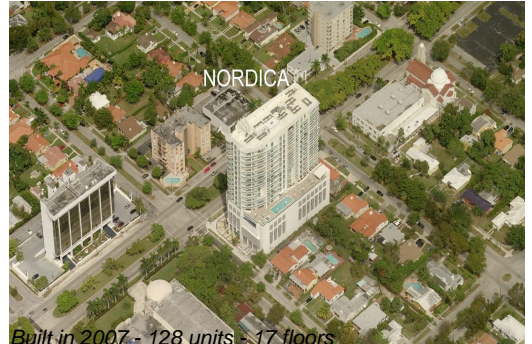
Built in 2007 - 128 units - 17 floors