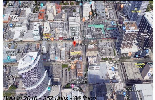
Built in 2016 - 352 units - 36 floors