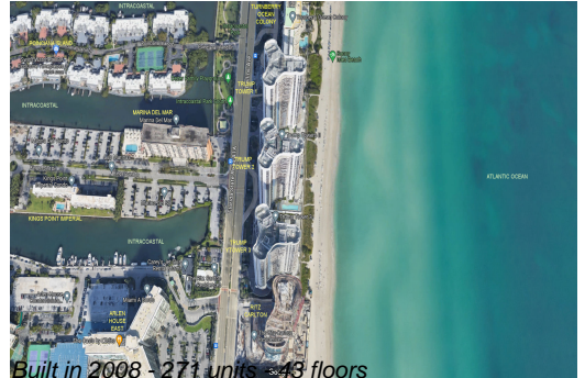
Built in 2008 - 271 units - 43 floors