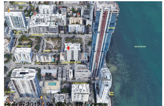
Built in 2012 - 96 units - 18 floors