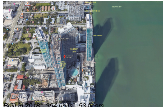
Built in 2018 - 364 units - 53 floors