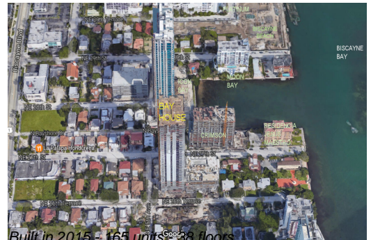
Built in 2015 - 165 units - 38 floors