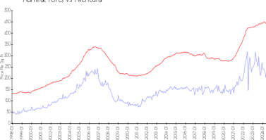
Admiral Ports vs Aventura