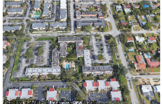
Built in 1976 - 105 units - 2 floors