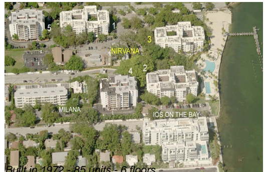
Built in 1972 - 85 units - 6 floors