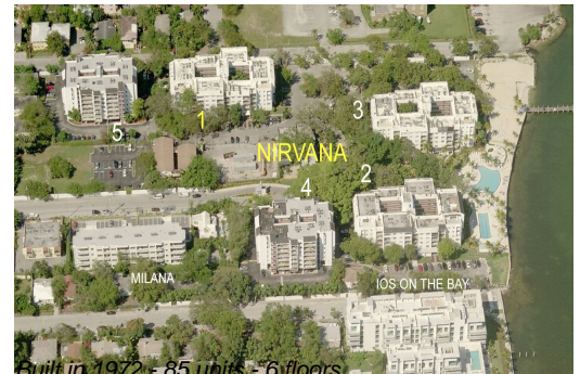
Built in 1972 - 85 units - 6 floors