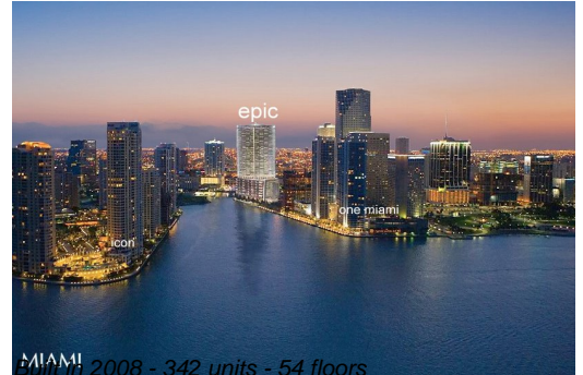
MIAMI 2008 - 342 units - 54 floors