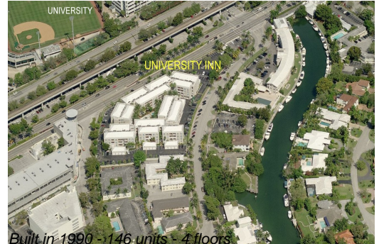
Built in 1990 - 146 units - 4 floors

Number of units: 146 Number of active listings for rent: 8 Number of active listings for sale: 0 Building inventory for sale: 0% Number of sales over the last 12 months: 6 Number of sales over the last 6 months: 5 Number of sales over the last 3 months: 1