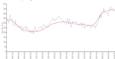
Turnberry Village North Tower vs Aventura