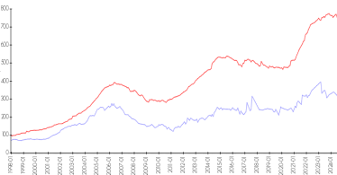
Winston Tower 200 vs Sunny Isles