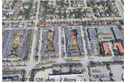
Built in 1971 - 126 units - 2 floors