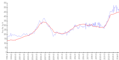
Yacht Club at Aventura vs Aventura