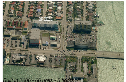
Built in 2006 - 66 units - 5 floors