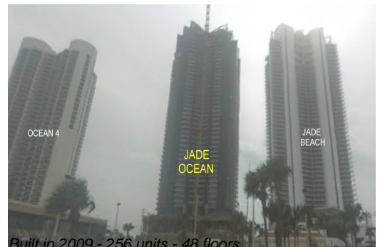
Built in 2009 - 256 units - 48 floors