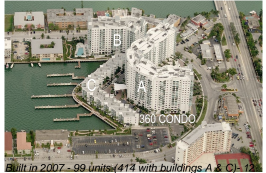
Built in 2007 - 99 units (414 with buildings A & C) - 12 floors