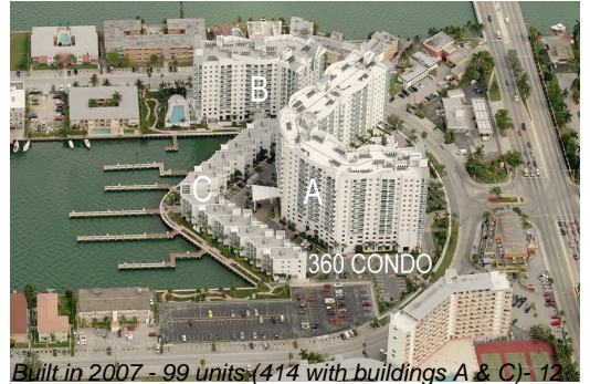
Built in 2007 - 99 units (414 with buildings A & C) - 12 floors