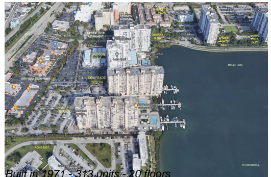
Built in 1971 - 313 units - 20 floors