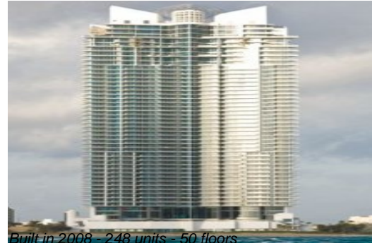
Built in 2008 - 248 units - 50 floors