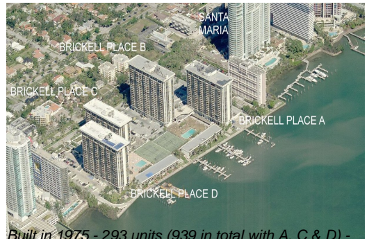
Built in 1975 - 293 units (939 in total with A, C & D) - 26 floors