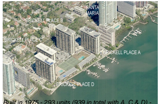
Built in 1975 - 293 units (939 in total with A, C & D) - 26 floors