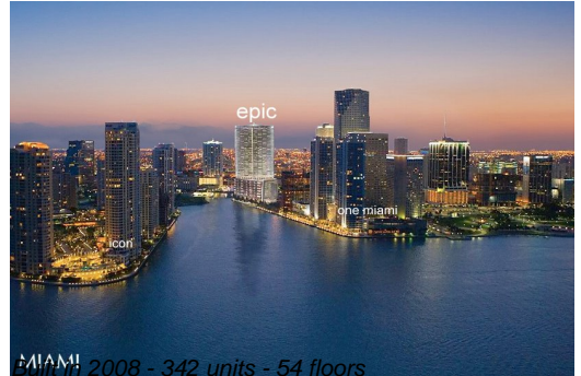
MIAMI 2008 - 342 units - 54 floors