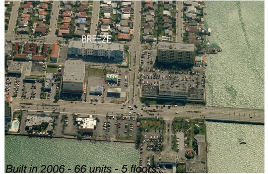
Built in 2006 - 66 units - 5 floors