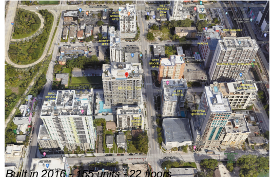
Built in 2016 - 155 units - 22 floors